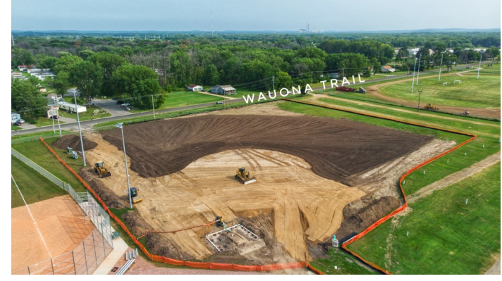
Drone picture of new ball field construction

Construction on the 2nd ball field at the Fairgrounds is underway. This will be a multi-use field and will host our Adult Softball games, Youth T-Ball Programs, Masters Baseball Program, as well as our Youth Flag Football utilizing the outfield grass in the spring and fall. This field will also be available for local teams as a practice site, and we hope to host youth softball, youth baseball, and adult softball tournaments in the near future!